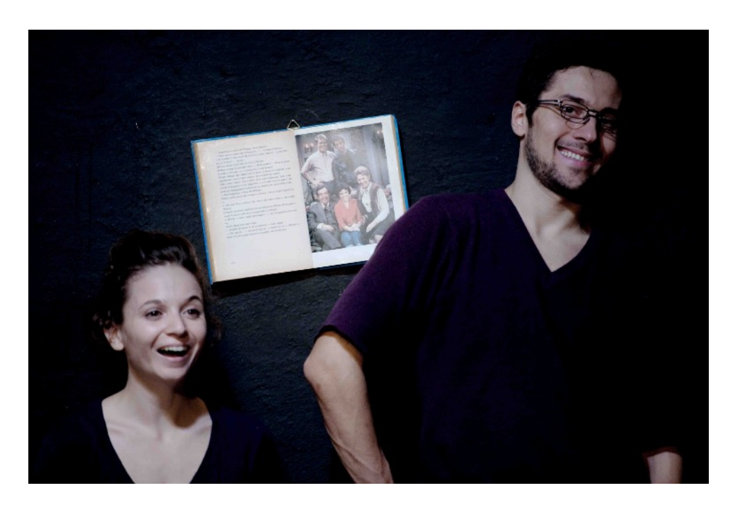
Culture is the resistance to the distraction Pier Paolo Pasolini

Corpo e Cultura is a performative project that never repeats itself. Its perpetual evolution stems form its ever-changing core, which is made by the people and the culture of the territory that welcomes this production. This performance is created in two phases: data collection and choreographic creation. During the former, the performers collect audio and video material by interviewing people who are at that time present in the place where the performance is held. The questions they ask mainly concern cultural memories that dwell in the minds of the interviewees. These tellings and retellings are then edited and put together to become the soundtrack of the show. The second part of the project is the physical rewriting of these cultural testimonies which results into the bodyfication of such memories. The people of the place, as well as the place itself, become not only the real protagonists of the show, but the basis on which the whole performance lies. Corpo e Culture represents a wonderful opportunity for a community of people to look within, talk and learn about itself, by fostering a powerful reflection on the very human question "Who are we?".