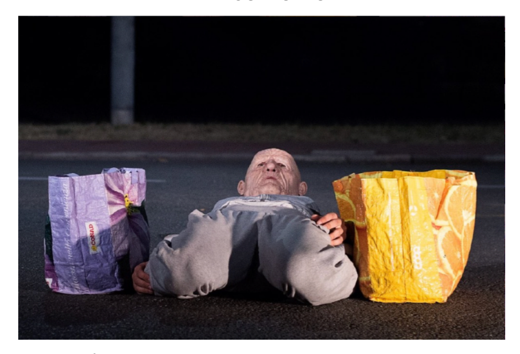
Nato ai bordi di periferia, dove i tram non vanno avanti più, dove l'aria è popolare, è più facile sognare che guardare in faccia la realtà.