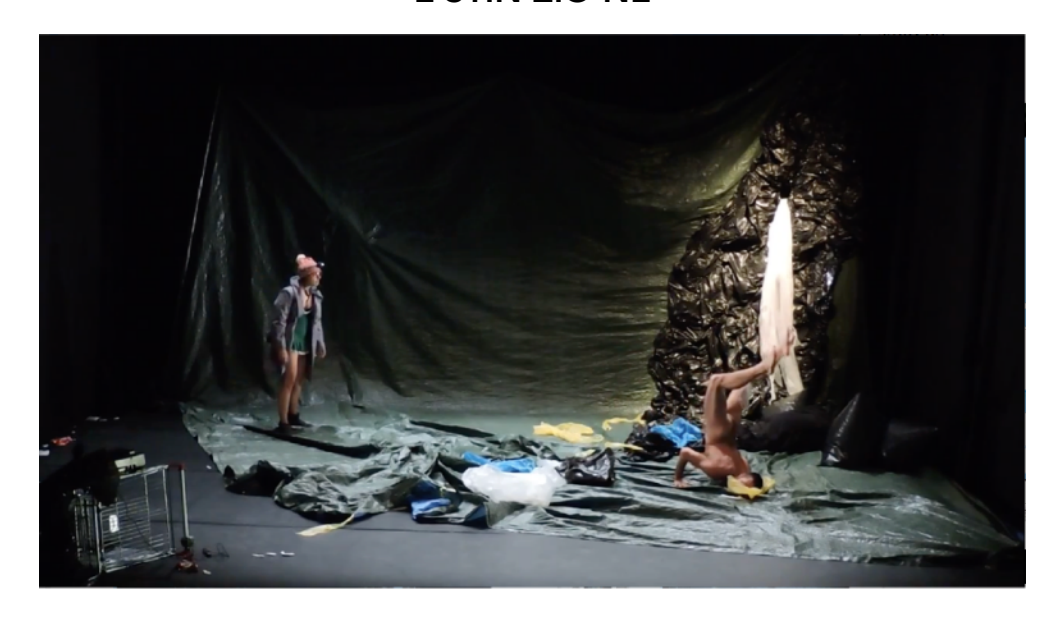
A trash-tsunami. The leftovers of our civilization come out from the trash. They are survivors. A young girl walks out of cloths. She is lost. It has been a Black Friday. An Apocalypse.

Carlo Massari/ C&C , Alice Conti/ ORTIKA and Chiara Osella link their own plots and aesthetics into this work, starting from their universes, which are considered being far apart one another (acting, dance and opera singing.) Their aim is not only to mix their different artistic languages, but actually to break the borders between them. They join into a unique and heterogenous group of work, trying to become one whole community on the edge. By mixing and sharing different skills (opera singing, acting, physical theater, contemporary dance, performance) they write onto the stage their own rules and will. They choose The End as scenario, the very end. Isn't there a better one to make a new language be born?