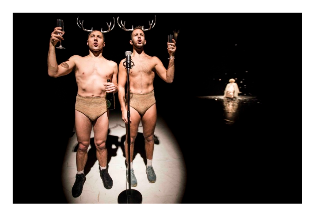
The creatures outside looked from pig to man, and from man to pig, and from pig to man again; but already it was impossible to say which was which.