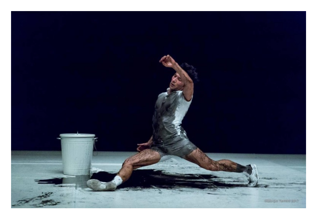
I wanted to be loved cause I was great, a Big Man. Now I'm nothing. Look. The glory around... trees, birds... I dishonored it all and didn't notice the glory. A foolish man.